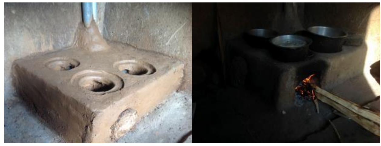
The firewood saving stove that accommodates three cook items at once with one inlet for firewood as opposed to the traditional one with 3 firewood entry spaces and one cook place. This stove saves more than 60% of the firewood that would otherwise be used.

FED continued to promote, support and facilitate the increased use of Fuel wood saving stoves as a strategic way of reducing deforestation. Biomass is still the most important source of energy for the majority of the Ugandan population. About 90% of the total primary energy consumption is generated through biomass , which can be separated in firewood (78.6%) , charcoal (5.6%) and crop residues (4.7%) .