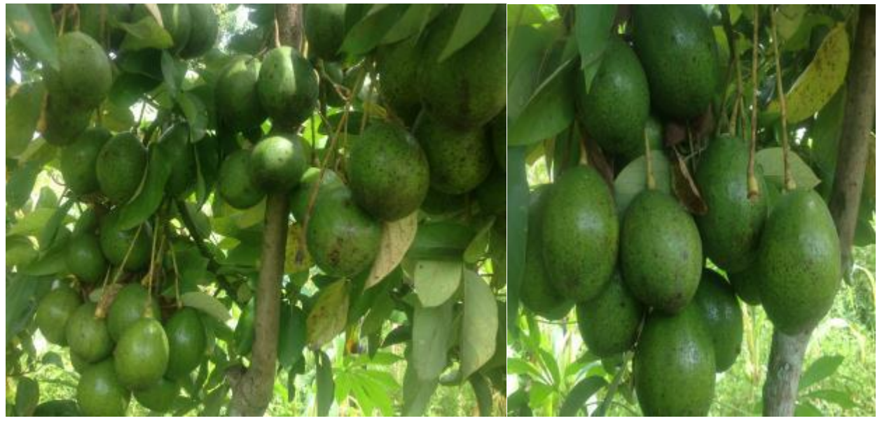
One of the highly productive of Margret

The benefit from goats and chicken is not only from the off-springs produced by the original stalk given, and the eggs in the case of chicken, but also the droppings (dung) from both the goats and chicken, is collected and combined with other plant materials and kitchen refuse and crop residues to make compost manure which is used to fertilize the soil and make it more productive organically. The result of the fertilized soil is high and health organic vegetables like those examples above and the healthy and high yielding of the fruits like the avocados, passion fruits and tomatoes as can be seen below.